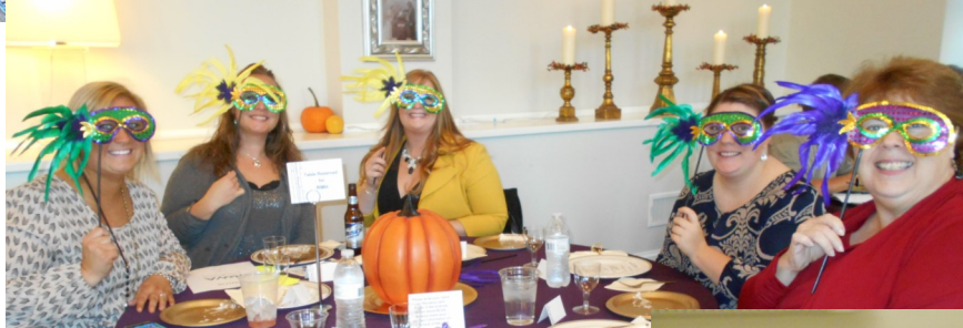
Photos from the Masquerade Ball